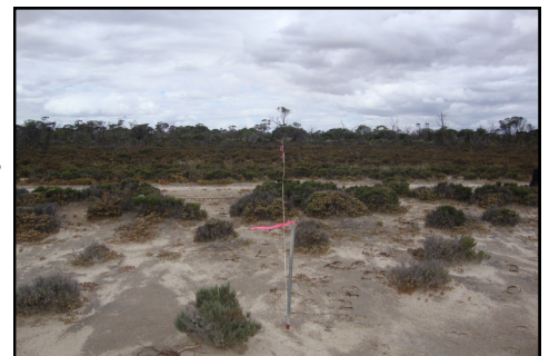
Transect at Mongers 55